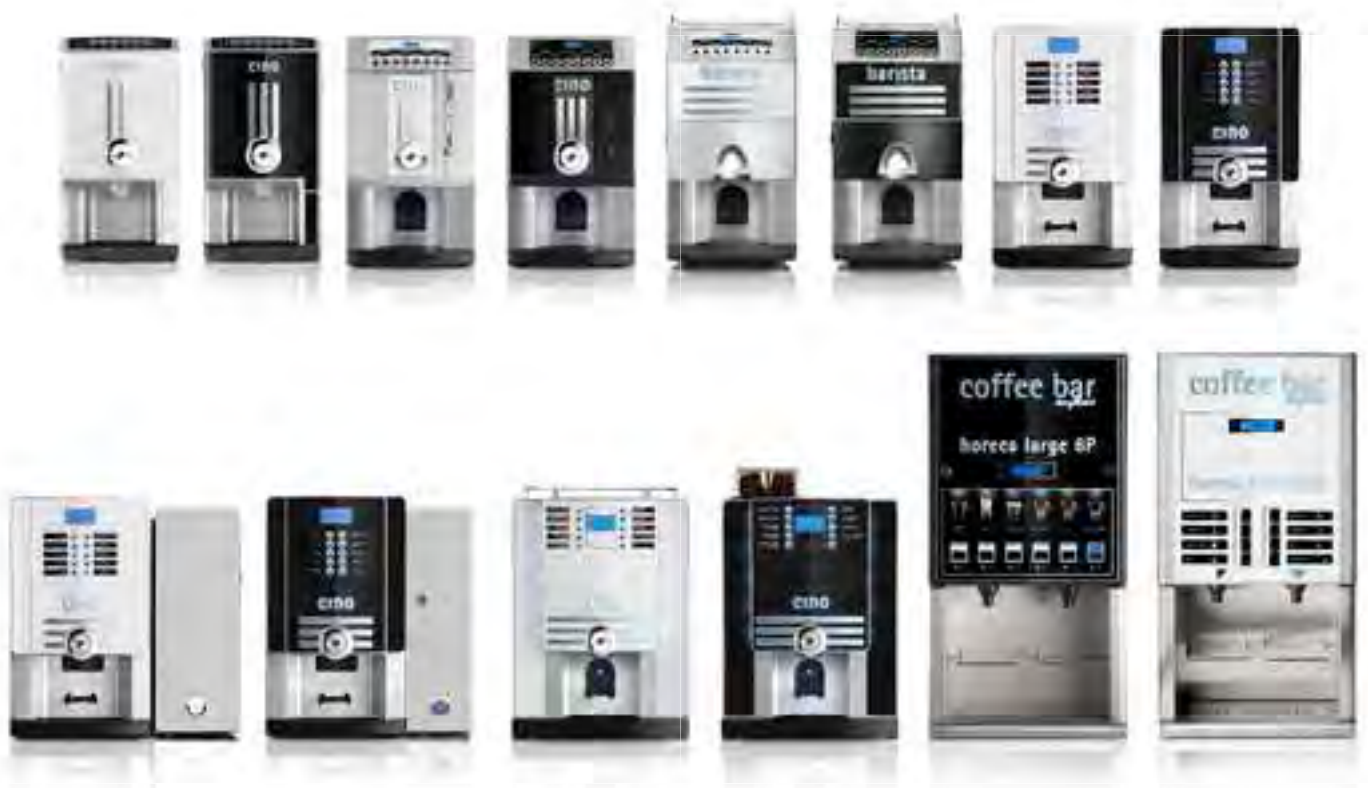
TABLE TOP MACHINES